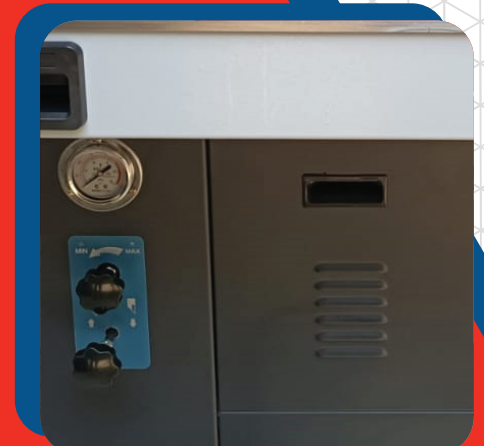
MECHANICAL HYDRAULIC SYSTEM